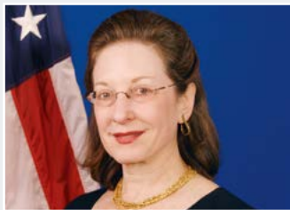
Shira Perlmutter Chief Policy Officer & Director of International Affairs at the U.S. Patent & Trade Office